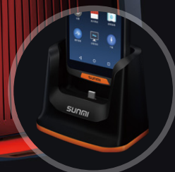
Optional single stand charger