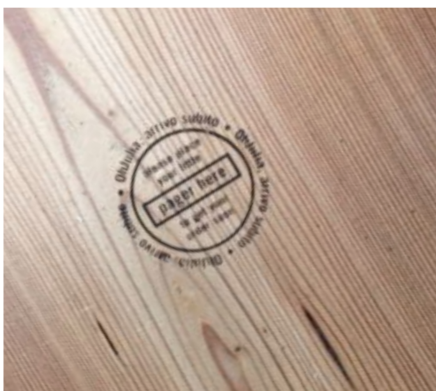
Burning mark on a wooden table Oh Julia, Munich, Germany