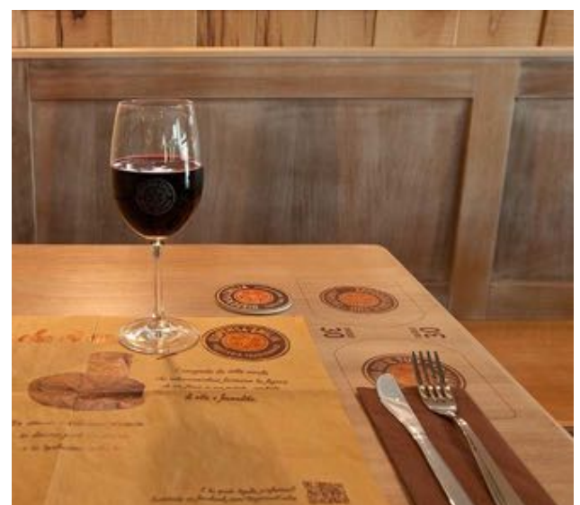
Painted marks on a wooden table Dispensa Emilia, Modena, Italy