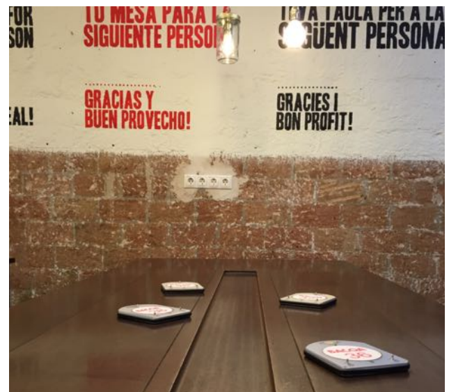
All-over lamination below a wooden table BACOA, Barcelona, Spain

If you want to stick the tags on the top, we recommend you a special label to protect the tag against vandalism.